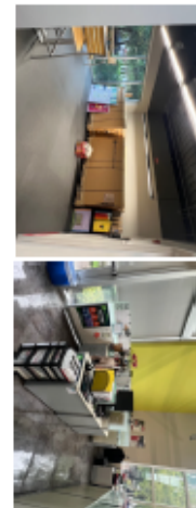
HOUSING DEPT (112)